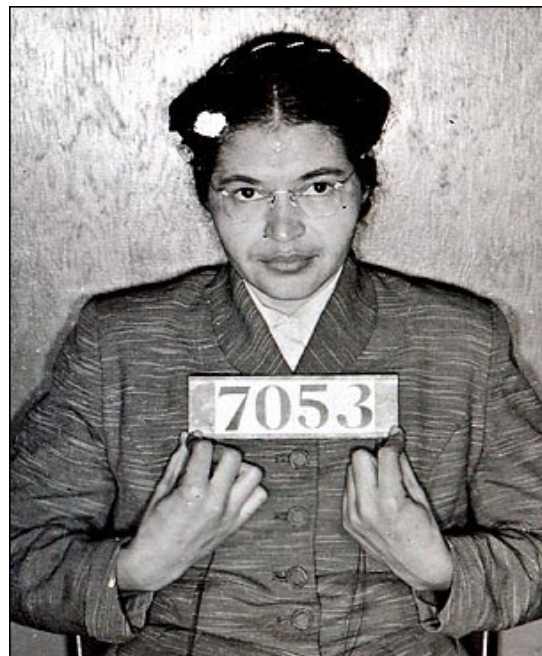
Montgomery Sheriff's Department booking photo of Mrs. Parks.

Mrs. Parks was a simple, strong woman who has become a symbol of "the power of one." A seamstress, she was a person full of dignity and self-respect. On December 1, 1955, when she refused to give up her seat on the bus to a white person, she was told by the bus driver, "I am going to have you arrested." Rosa Parks replied, "You may do that." That act