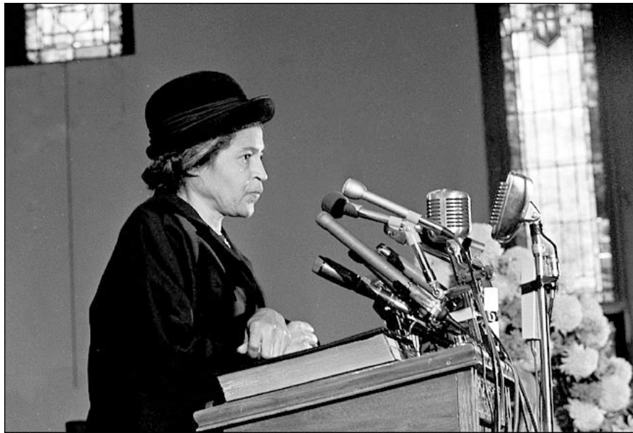
Mrs. Parks speaking at Ebenezer Baptist Church in Atlanta on Jan. 15, 1969.

(The St. Francis/St. Joseph Catholic Worker House is a 501-(C)-3 Tax exempt organization)