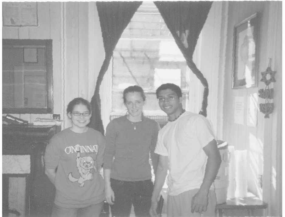
University of Cincinnati Volunteers for the Soup Kitchen, from the St. Monica Newman Center

WISH LIST towels, wash cloths coffee, sugar